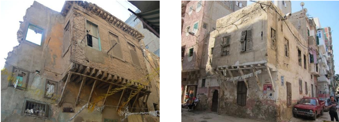
Fig. 7 Pictures of the two oldest surviving traditional Ottoman style buildings at Kom El-Dekka, locally called; Turkish style. Reference: Authors