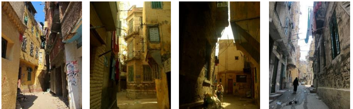
Fig. 4 Pictures of the street morphology at Kom El-Dekka.

The urban pattern at Kom El-Dekka is considered organic; it is typical to street fabric in traditional areas, such as Khan El-Khalili in Cairo. The urban pattern at Kom El-Dekka also follows the topographic characteristics of the area. The traditional Islamic city that was formed one thousand years ago affected future developments in the 19th century and beyond. The social relations and coherent way of life of the inhabitants affected the typologies in which formed the streets and the style they built their homes. The streets are formed with slopes or steps. Their widths determine usage by pedestrians or carts. Small allies and dead-ends are commonly cited in the area. The urban fabric established in this traditional neighborhood reflects the socio-cultural aspects of its inhabitation. Dissimilarity of street fabric at Kom El-Dekka with regards to surrounding areas is evidence to the private nature and close relations between its inhabitants. Pictures in figure 4 present street morphology at Kom El-Dekka.