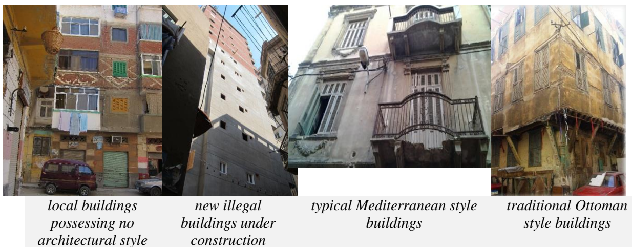
Fig. 5 Pictures of architecture building styles at Kom El-Dekka.

The rest of the buildings in the area that are now starting to grow and swallow the traditional unique fabric are the illegal residential apartment buildings (13-17 floors) made out of concrete and cement. They lack any architectural style or planning regulations. They represent a threat to the local community and pressures on the infrastructure, electricity and streets. They overshadow streets, totally preventing sun light, ruining air quality and destroying the social and cultural heritage of Kom El-Dekka. Pictures in figure 5 present different building styles at Kom El-Dekka.