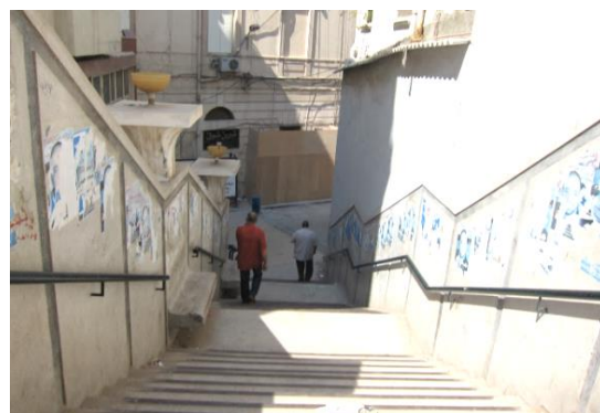
Fig. 1 Pictures of stairs used for entering Kom El-Dekka from Fouad